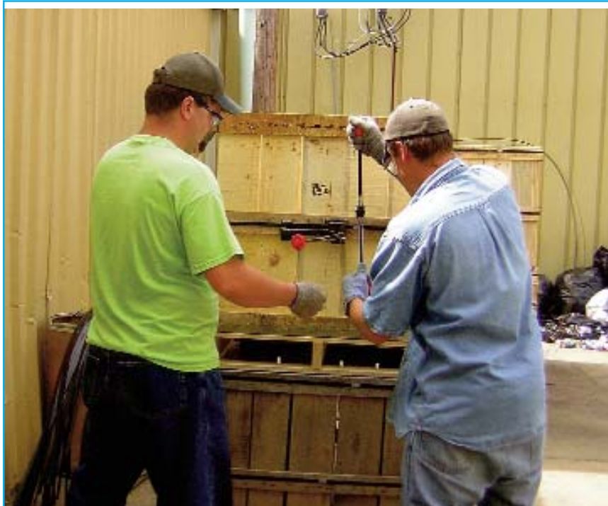
Workshop services include contracts with individual businesses, as well as community wide programs such as recycling.

It’s a formula that is a proven winner for Missouri and Missourians.